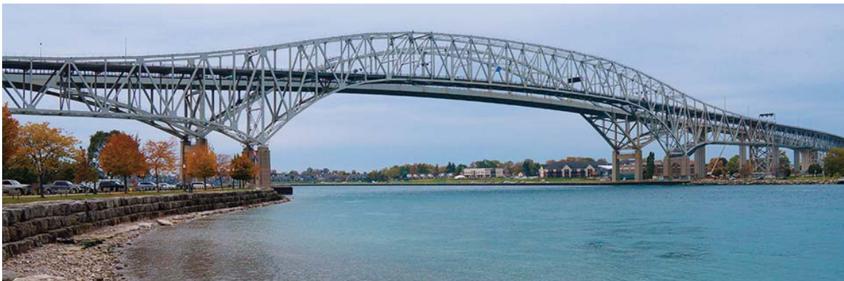
The Bluewater Bridge spans the St. Clair River connecting Port Huron, Michigan and Point Edward in Ontario