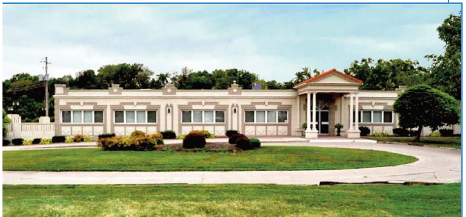
Greek Canadian Community 965 Sarnia Road (east of Hyde Park Road)

Continental breakfast included with all rooms. Reserve online.